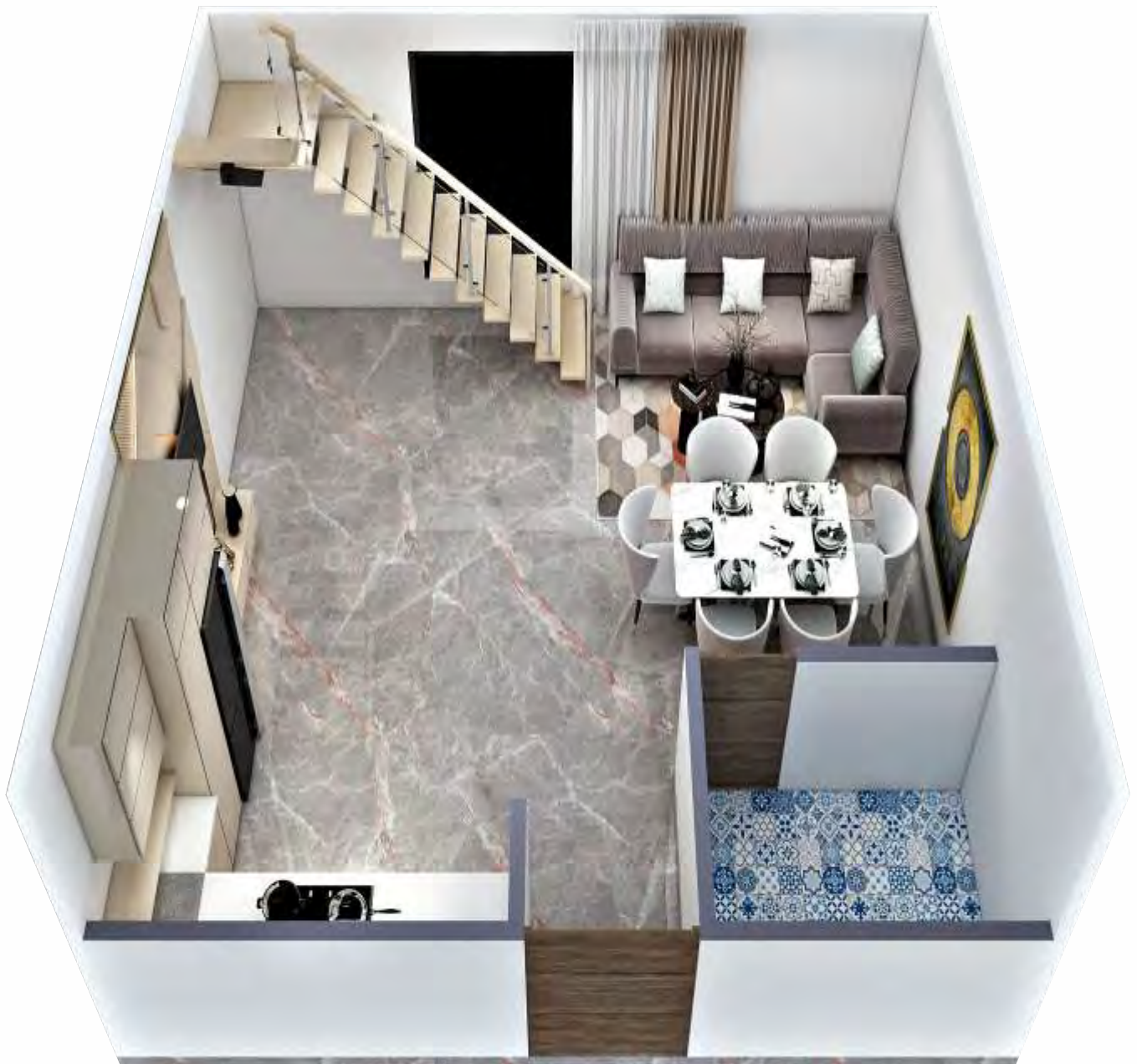
Duplex Unit Plan - 1300 Sq. Ft.