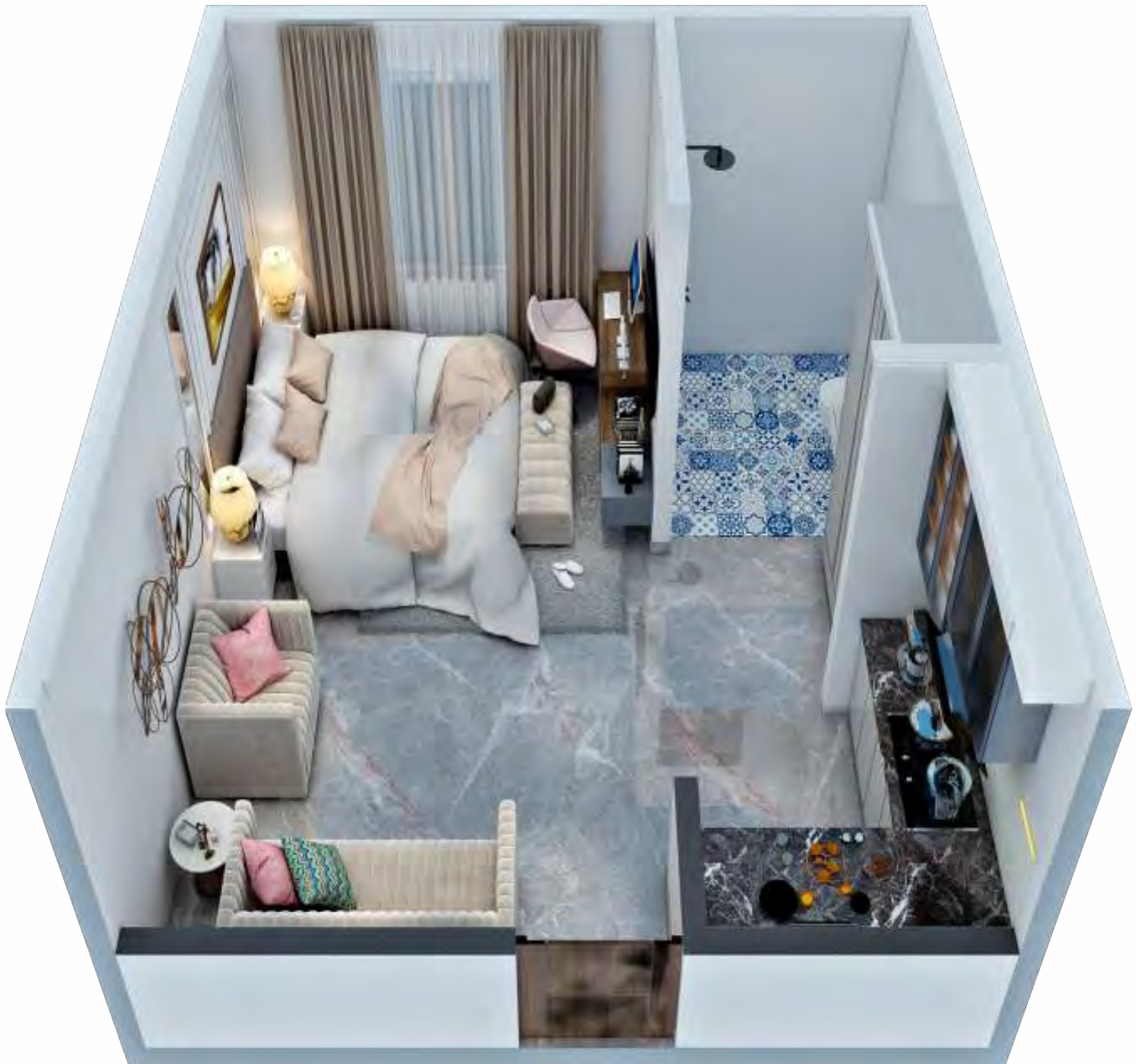
Unit Plan 2 - 700 Sq. Ft.