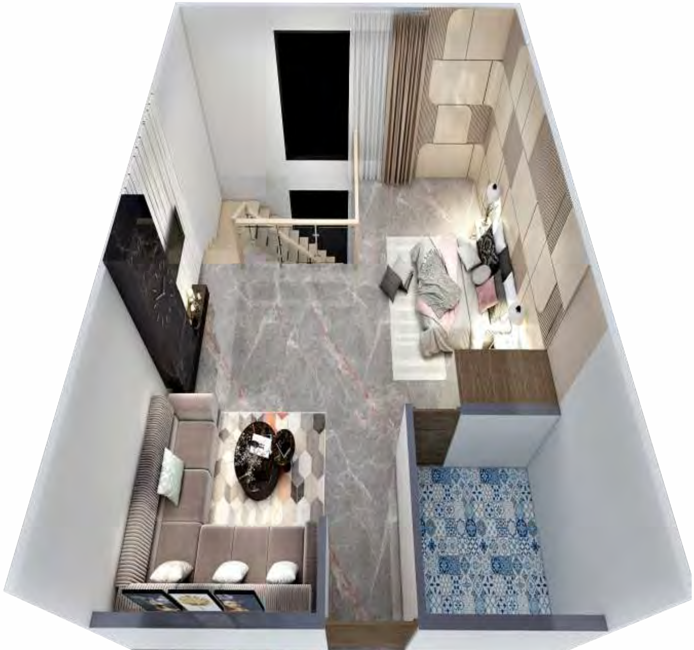
Duplex Unit Plan - 1300 Sq. Ft.