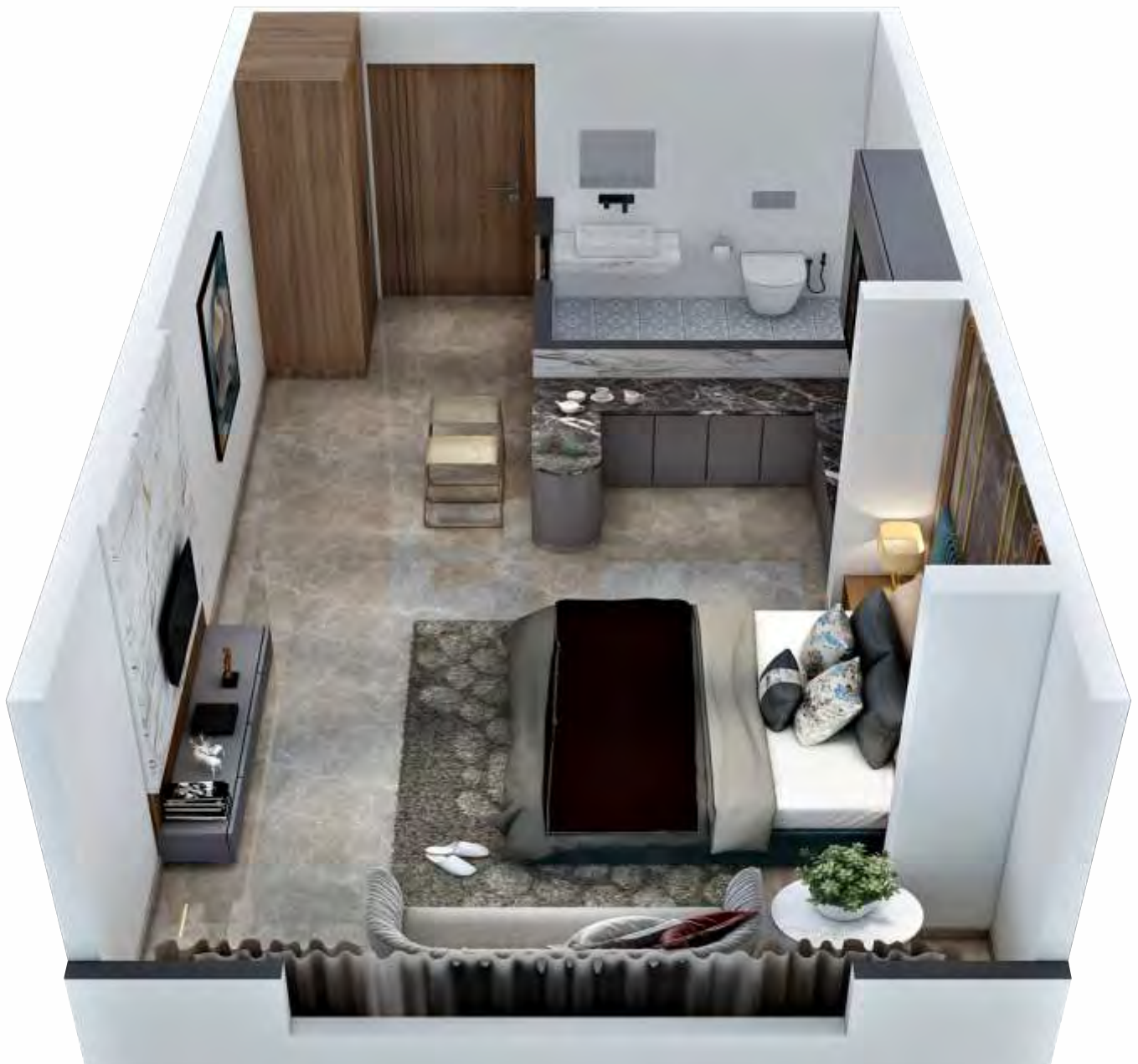
Unit Plan 1 - 650 Sq. Ft.