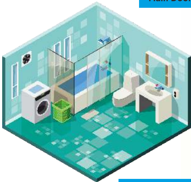
Motion Sensor in Washrooms and Kitchen