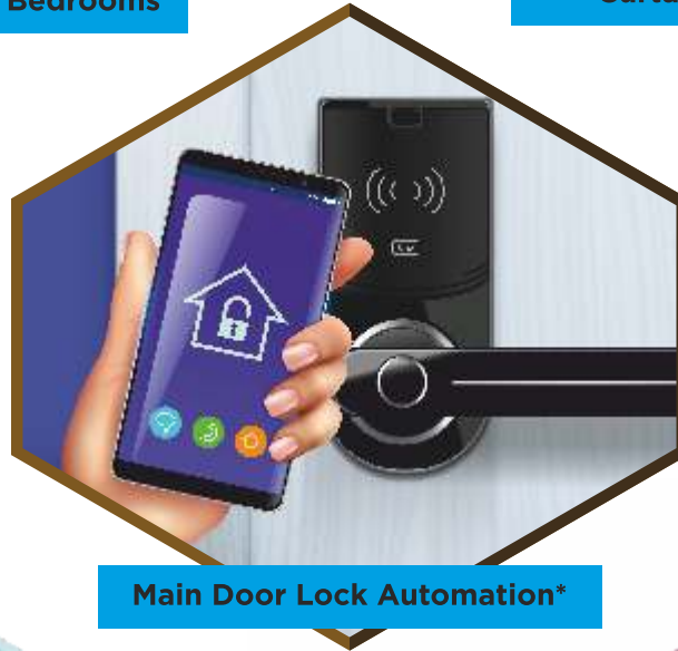
Main Door Lock Automation*