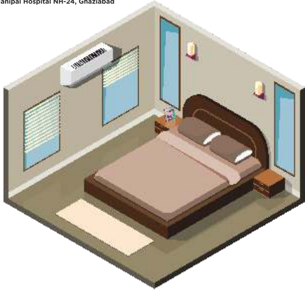
Automation of all Bedrooms