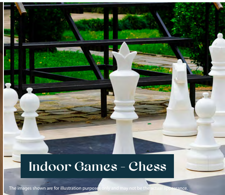
Indoor Games - Chess

The images shown are for illustration purposes only and may not be the actual appearance.