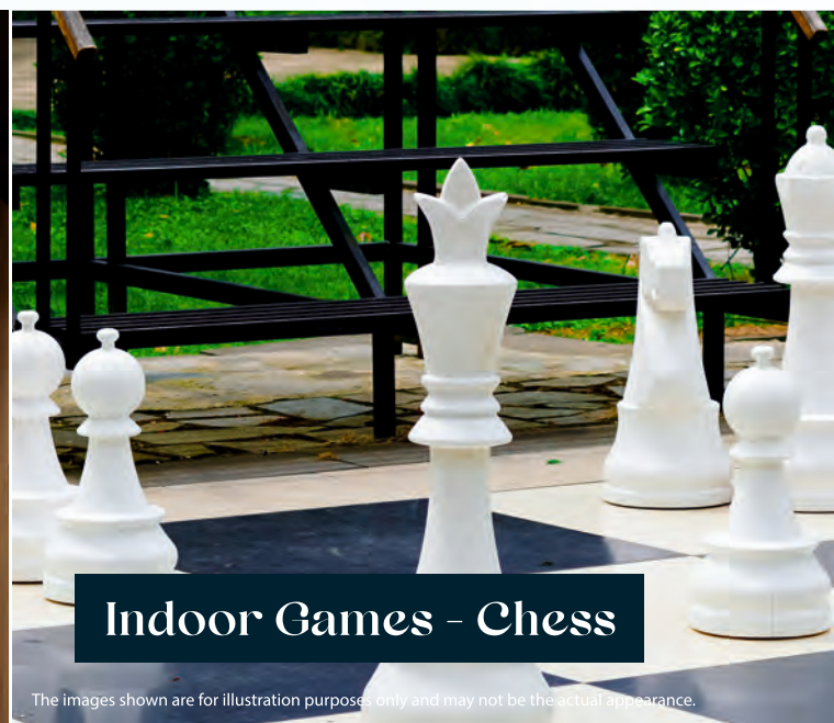
Indoor Games - Chess

The images shown are for illustration purposes only and may not be the actual appearance.