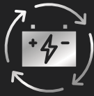
24x7 Power Backup