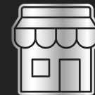
Commercial Shops for daily needs