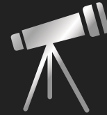
Star Gazing through Telescope